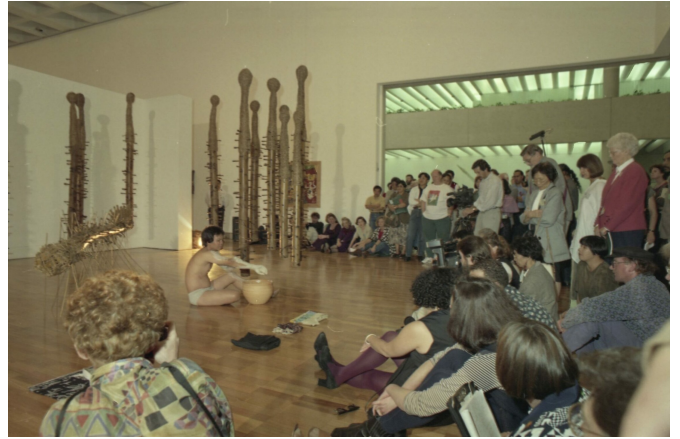
(left) Dadang Christanto performing For those: Who are poor Who are suffer(ing) Who are oppressed Who are voice less Who are powerless Who are burdened Who are victims of violence Who are victims of a dupe Who are victims of injustice for APT1, Brisbane CBD, September 1993 / Photograph: Christabelle Baranay / Image courtesy: QAGOMA Research Library / © QAGOMA; and (right) Dadang Christanto performing For those who have been killed 1992 for APT1 / Photograph: Christabelle Baranay / Image courtesy: QAGOMA Research Library / © QAGOMA

SE: And many of the exhibiting artists were present.