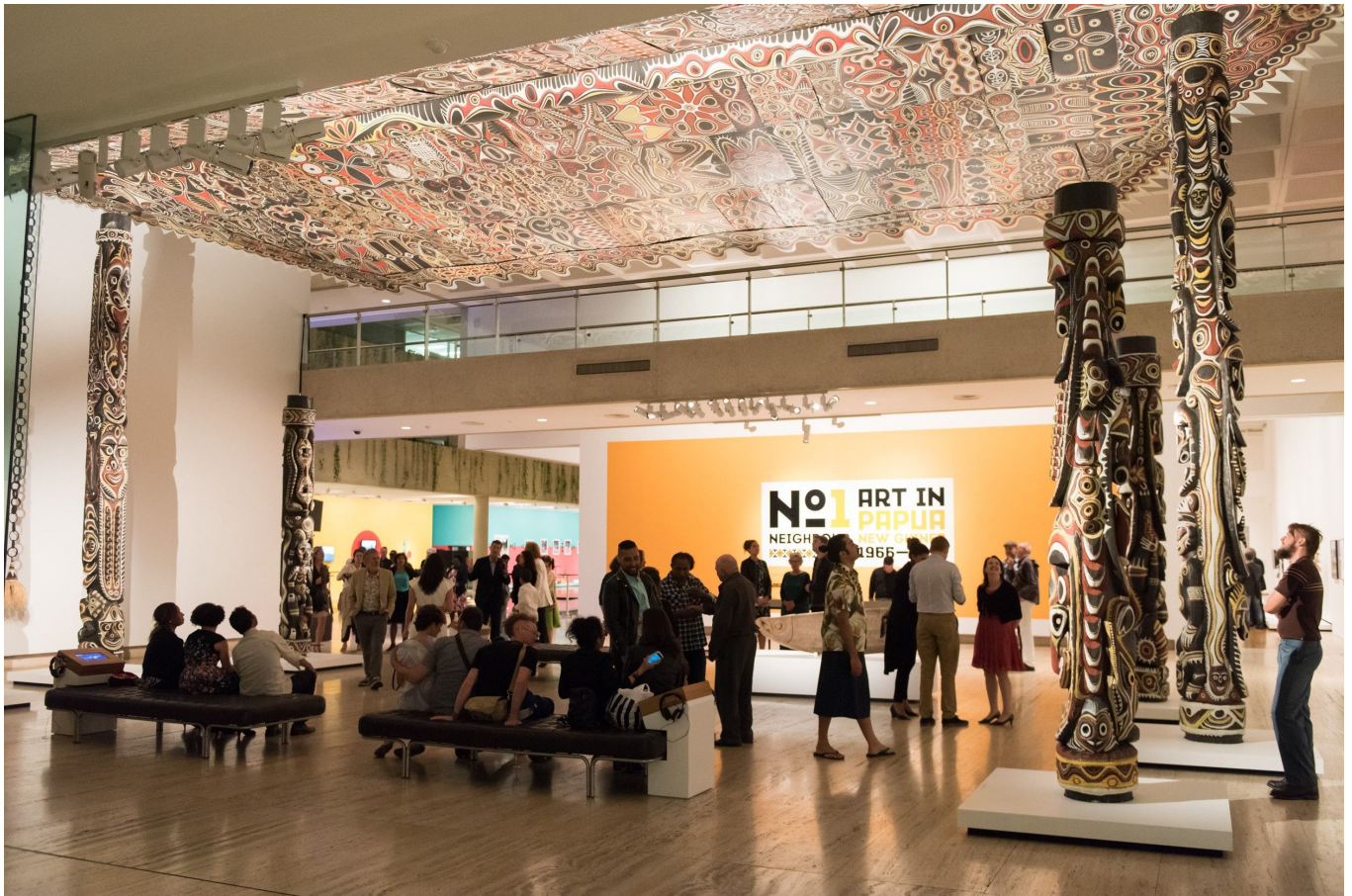
'No.1 Neighbour: Art in Papua New Guinea 1966–2016' opening night, Queensland Art Gallery, October 2016 / Photograph: Mark Sherwood

The Uramat Mugas (Uramat Story Songs) project, in development for 'The 10th Asia Pacific Triennial of Contemporary Art' (APT10), is the latest in a number of major projects commissioned by the Queensland Art Gallery | Gallery of Modern Art (QAGOMA) to engage with these practices in an attempt to acknowledge the full breadth of artistic expression across Papua New Guinea today. 2