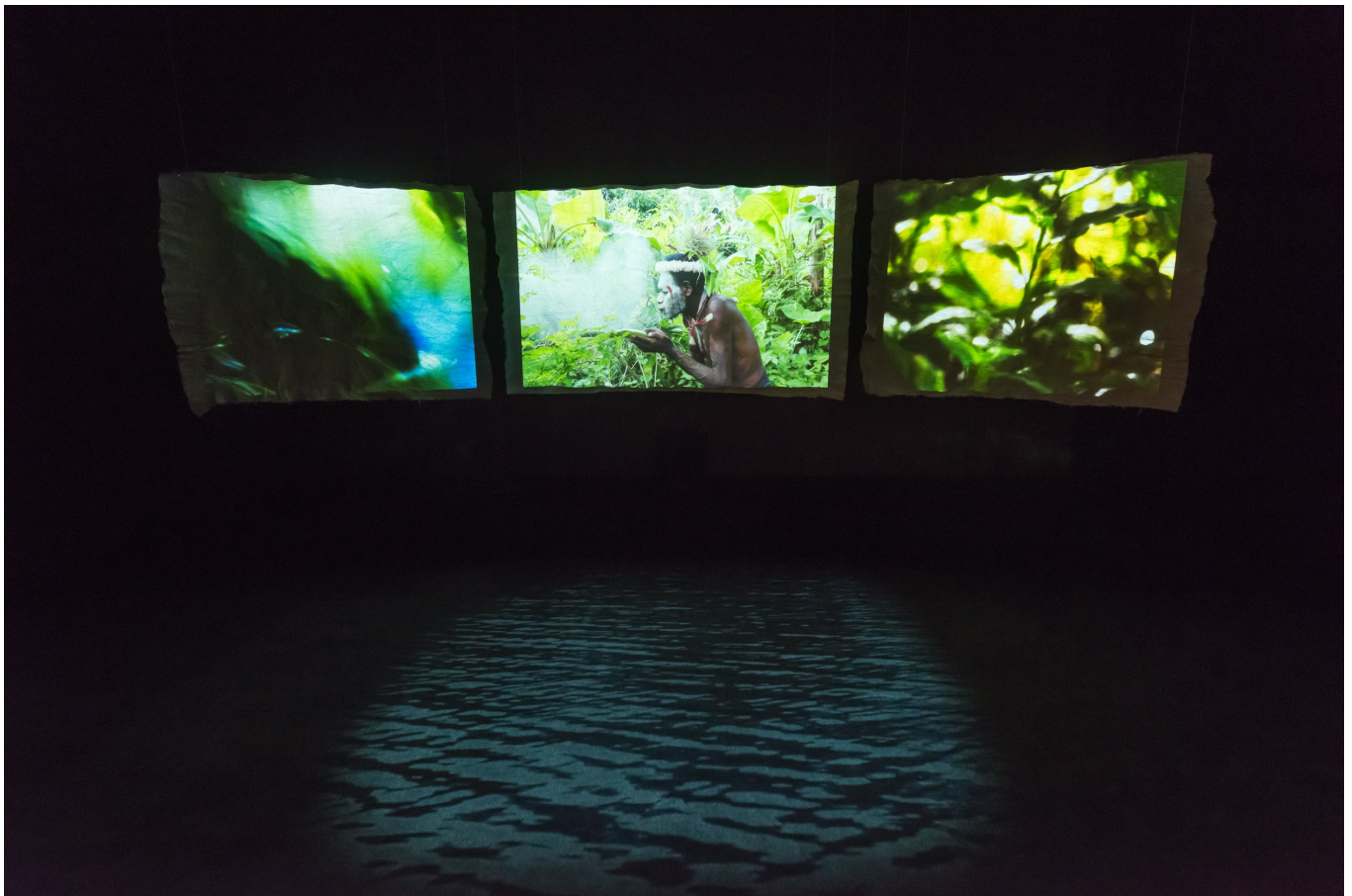
a Bit na Ta (source of the sea) 2016 (installation view), 'No.1 Neighbour: Art in Papua New Guinea 1966–2016'

Like the Uramat, the Gunantuna had also faced the prospect of cultural change and loss. One of the messages Kakabin had hoped to convey with a Bit na Ta (source of the sea) 2016 was how significant the retention of traditional Gunantuna cultural values and practices had been to the group's ability to successfully navigate change. Bringing together archival footage and the infectious rhythms of popular Gunantuna string bands, a Bit na Ta drew younger audiences to witness how — leading up to Independence in 1975 — the Gunantuna had mobilised their own strong relational economy to counteract the control of the colonial Australian government. 9