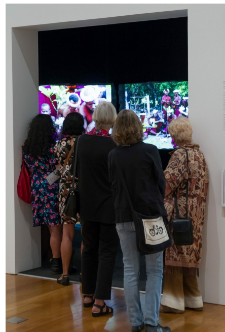
a Bit na Ta (source of the sea) 2016 (installation views), 'No.1 Neighbour' opening weekend, Queensland Art Gallery, October 2016