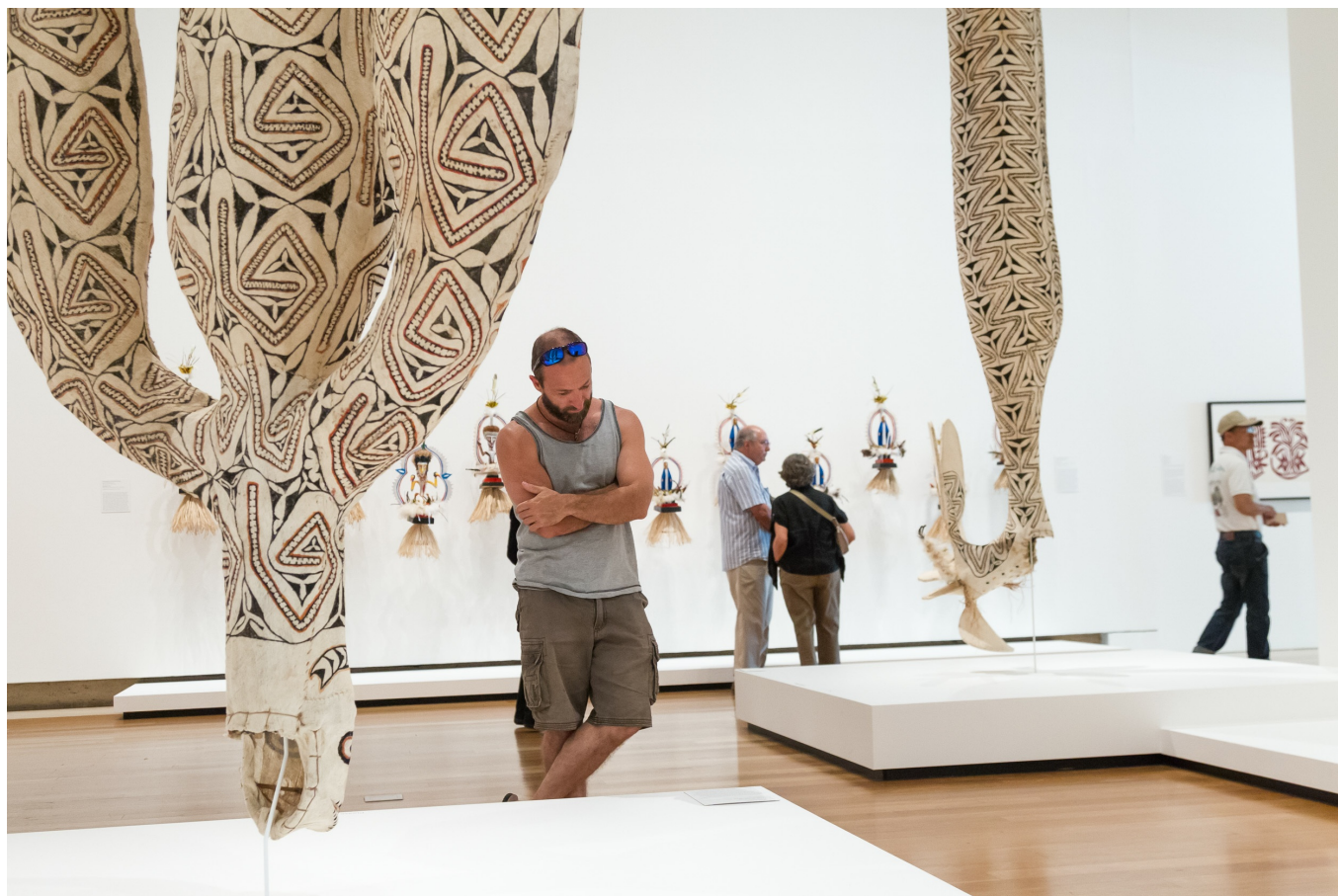
Audience viewing Uramat works at 'No.1 Neighbour' opening weekend, Queensland Art Gallery, October 2016