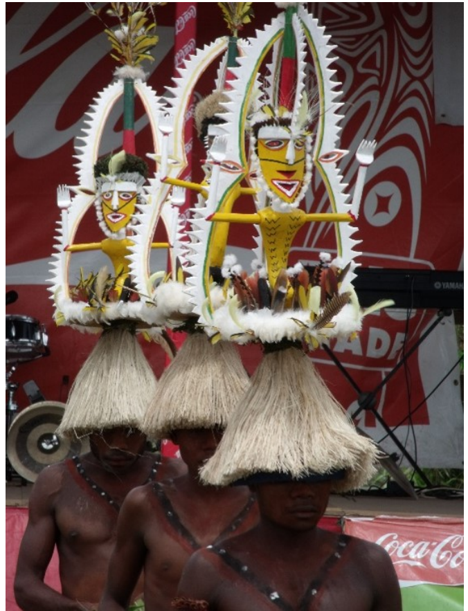
Gunantuna performances with Tabuan (ancestor spirit) (left) and Tokatokoi (headdresses) (right), July 2011