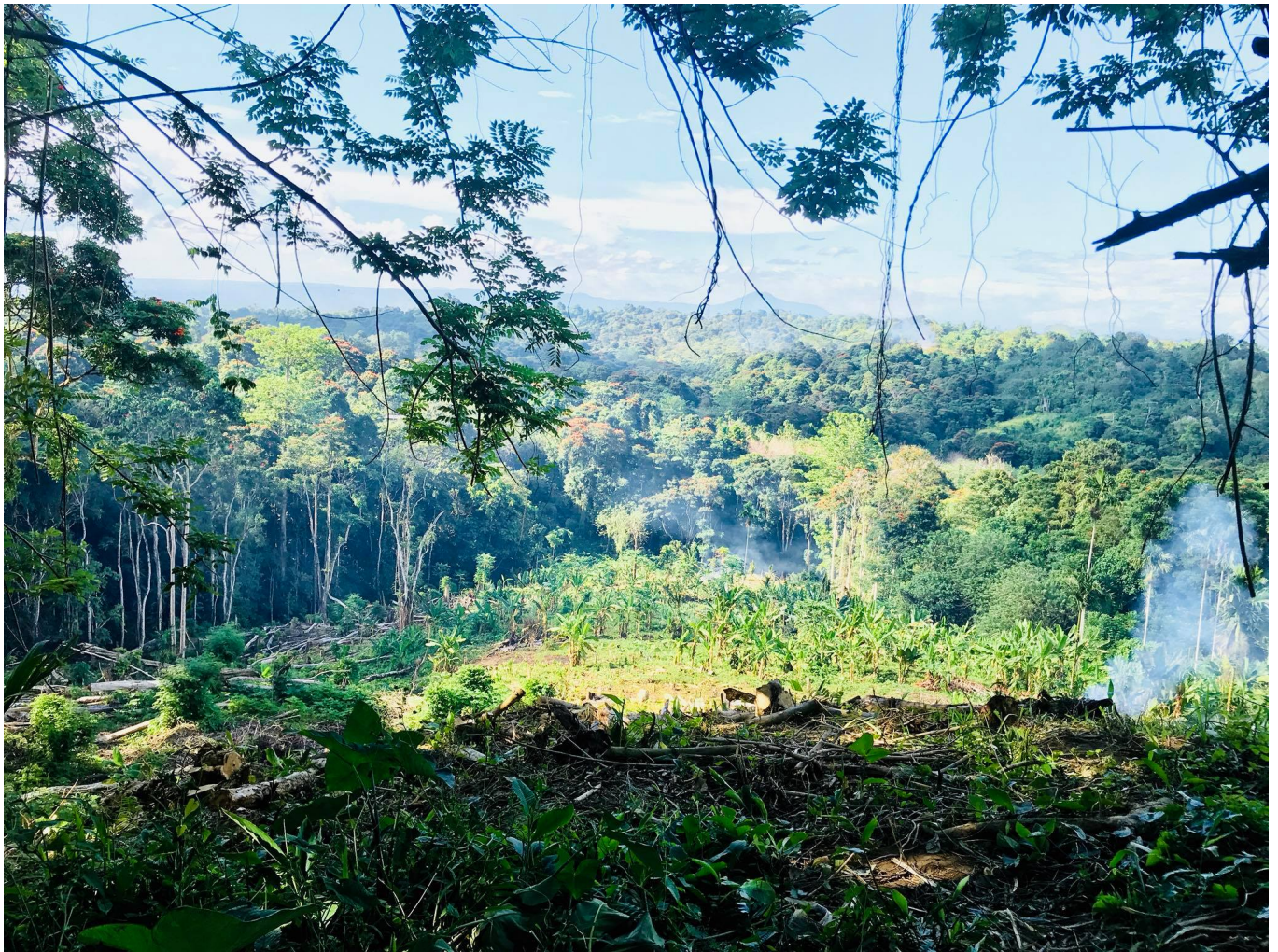
Cocoa rehabilitation, Gaulim, East New Britain