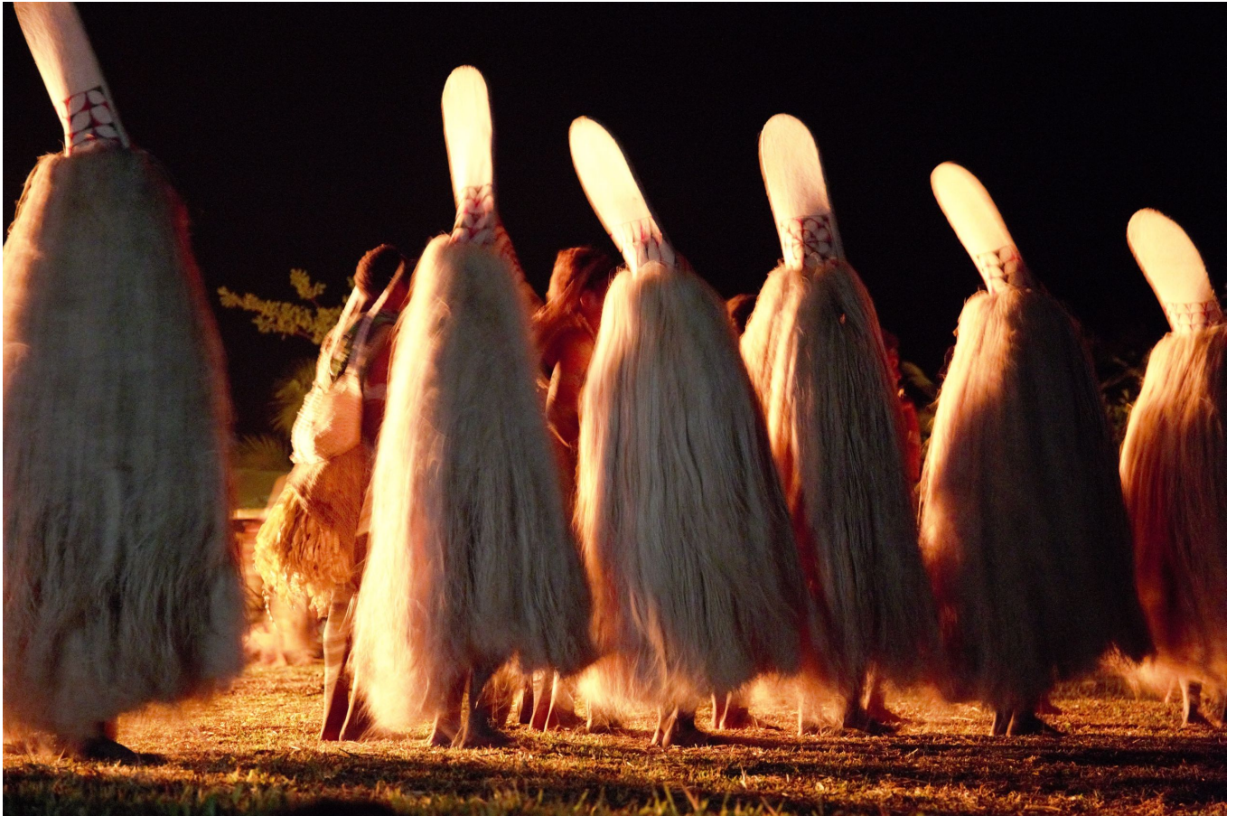
Uramat Sivirihki dance / Photograph: Gideon Kakabin / Image courtesy: Judy Kakabin

You can't know the content of artistic production just by mere display, there is a greater commitment one has to have, art historically and otherwise to be able to pull it off.