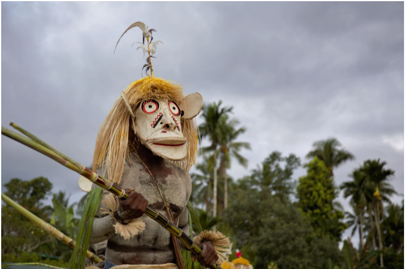
Uramat lhru figure, Gaulim, 2016