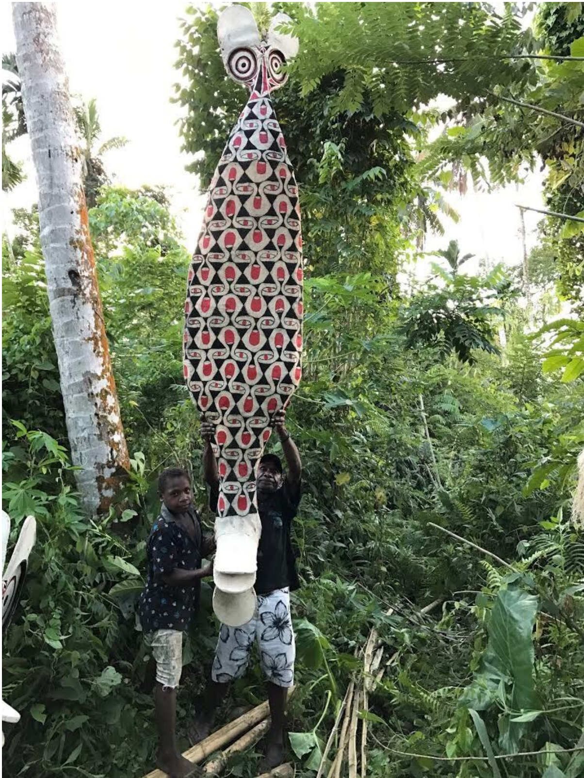
Allan Muvana and G Ezekia with Madaska mask, Gaulim, East New Britain, 2017