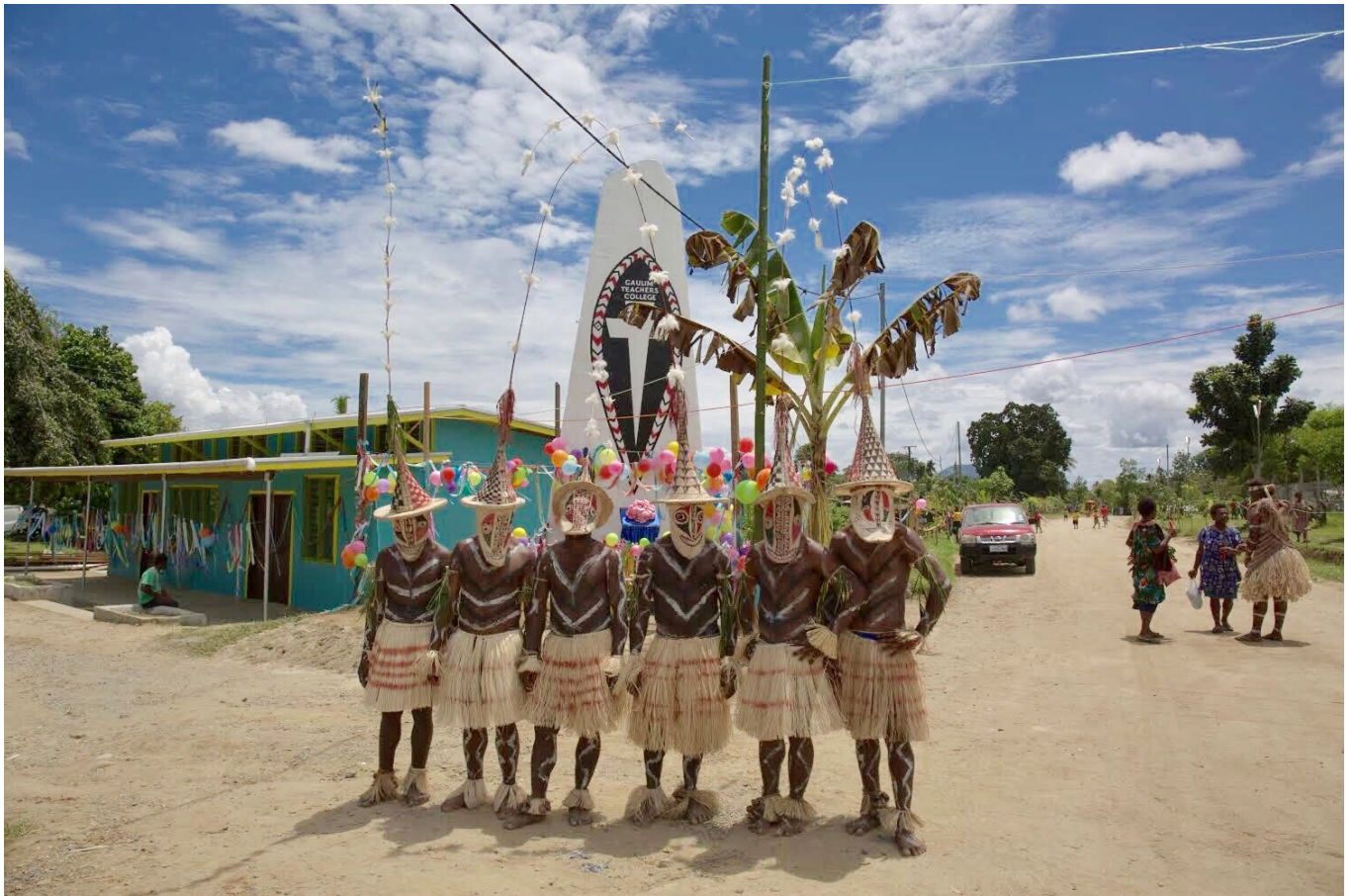
Varhit , Gaulim, 2016

In October 2016, Kakabin attended the opening of 'No.1 Neighbour: Art in Papua New Guinea 1966–2016' at the Queensland Art Gallery (QAG).